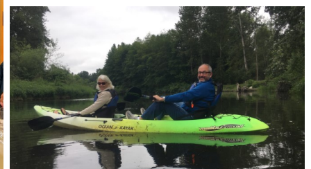
Kayaking on ????????