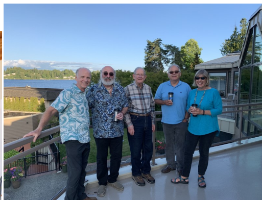
Progressive Dinner on Lake Stevens