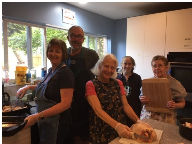
TBO members preparing dinner at the Interfaith family Shelter

Volunteers not only prepare the meal but then enjoy the fruit of their efforts by sitting down with the shelter residents to eat the dinner. Dinner is for about 30 people and is served between 5:00-5:30 pm.