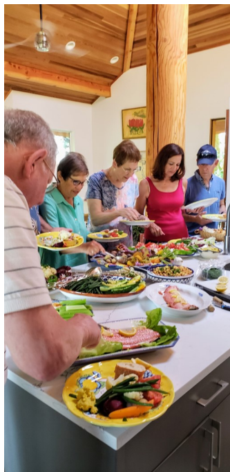
A lovely French Luncheon