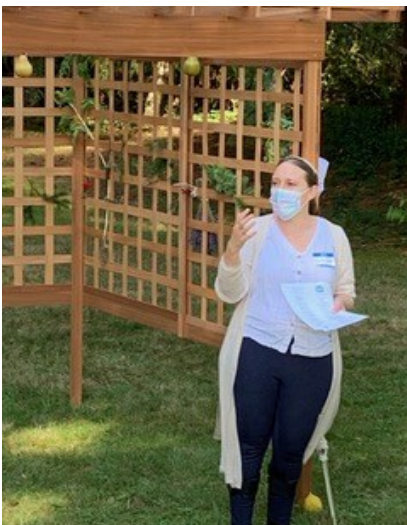
Rabbi at the Sukkah