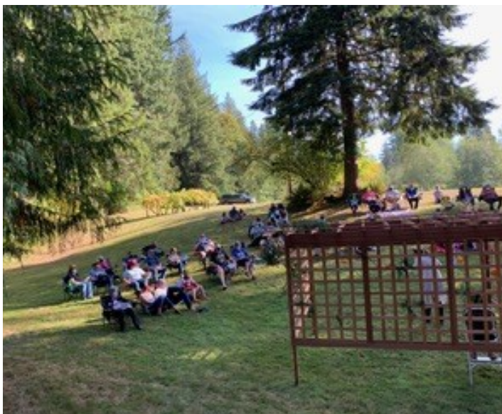
Gathering at the Sukkah