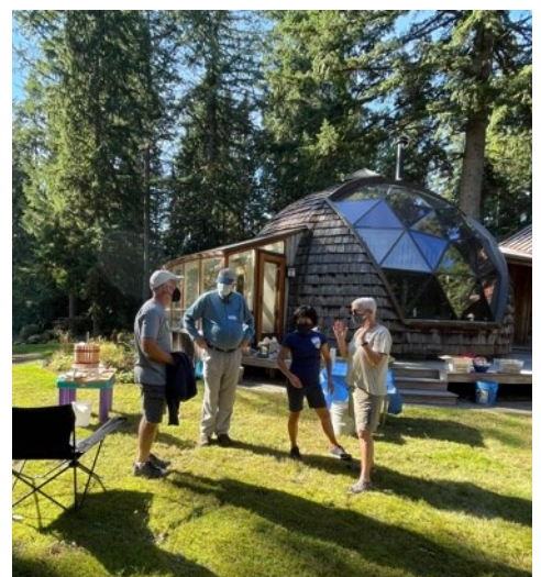
Social Distance Gathering