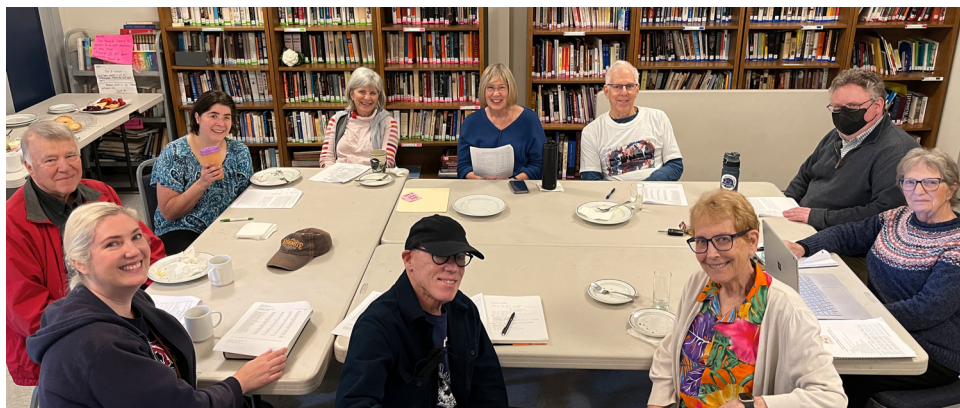
First in-person board meeting since the pandemic!