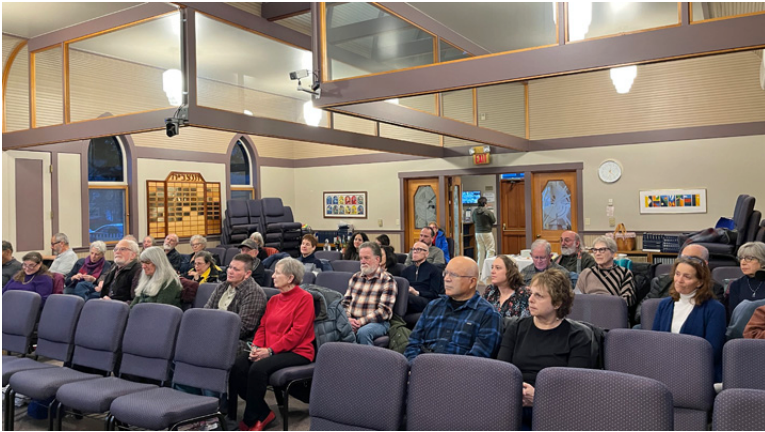
A nice turnout, and others on Zoom