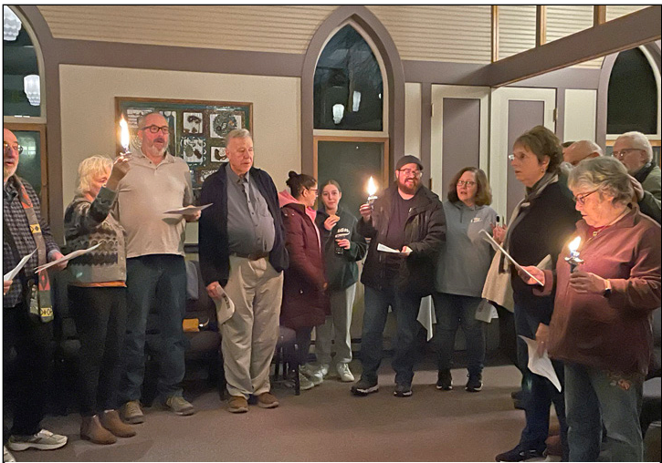
A warm Havdalah on a cold evening